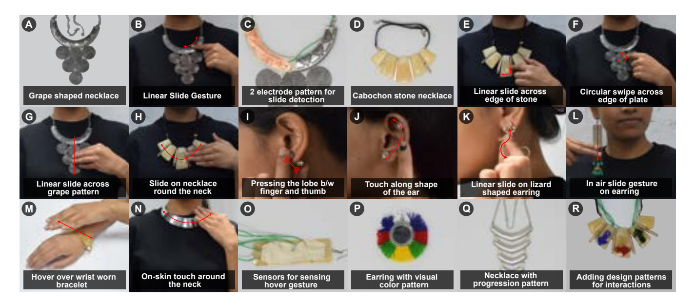
Figure 3: Exploring jewelry-enabled touch gestures